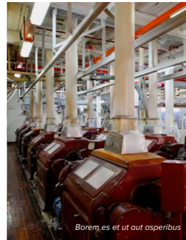
Borem es et ut aut asperibus

With their impressive engineering and architectural feats, the silo