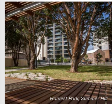
Harvest Park, Summer Hill

structures became aesthetically and historically significant for Summer Hill residents. However, operations were wound up in 2009 and the highly visible Flour Mill in the heart of Summer Hill stood forlornly vacant until established developer EG Funds Management , in partnership with Daiwa House Australia proposed a stunning new residential development to breathe new life into the industrial site.