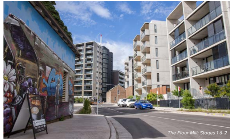
The Flour Mill: Stages 1 & 2

Mungo Scott's famous Flour Mill arrived in Summer Hill in 1922 with a cluster of functional milling and storage buildings. As Goodman Fielder grew the Mill's capacity in the 1950s, it added the landmark silos to store even more of the key ingredients for Australia's favourite loaves, creating a commanding and beloved presence over the surrounding suburban landscape.