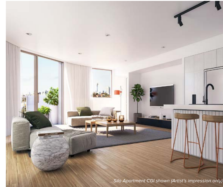
Silo Apartment CGI shown (Artist's impression only)

On completion, the Flour Mill community will consist of 360 contemporary apartments and terraces, surrounded by beautifully landscaped communal gardens, retail and commercial spaces with direct footbridge